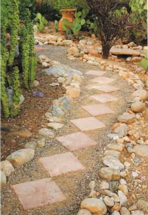
Pavers set in a diamond pattern between rows of rocks create a trail in this desert landscape.

turer. He says mulch retains water to reduce runoff, helps fertilize soil, and has a spongy texture that is soft underfoot. A compost mulch pathway will require occasional touch-ups, he comments.