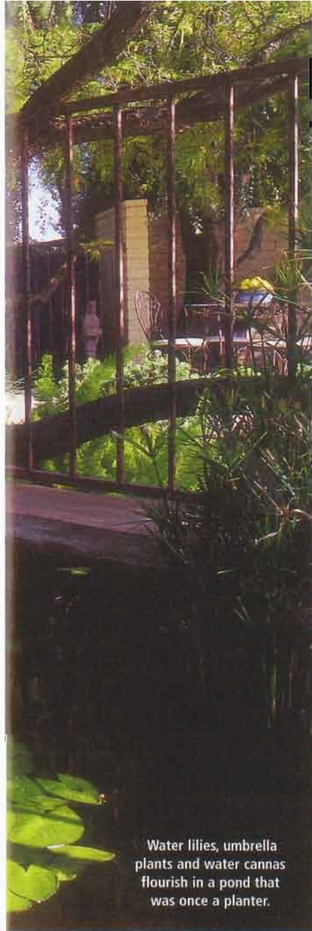
Water lilies, umbrella plants and water cannas flourish in a pond that was once a planter.