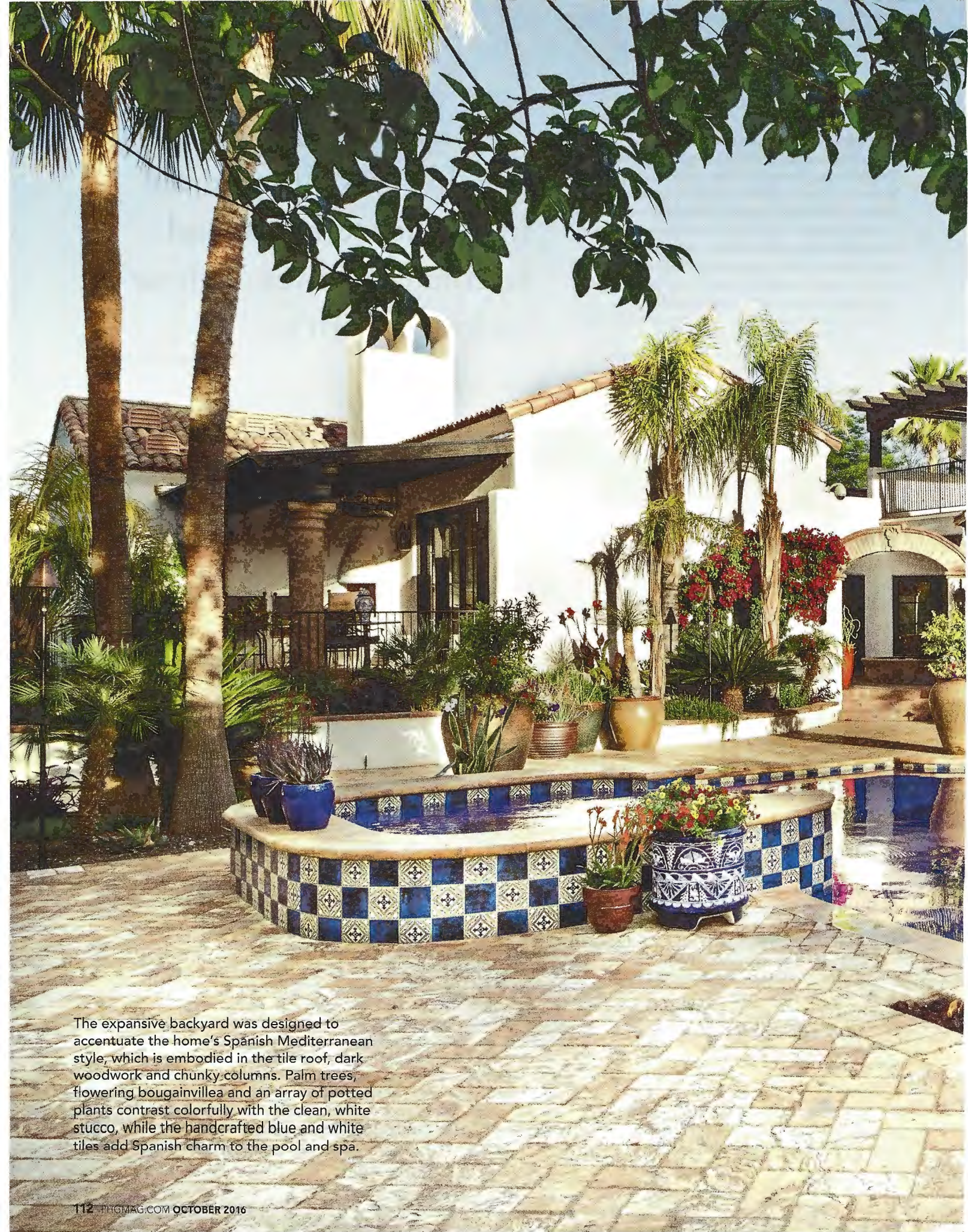
The expansive backyard was designed to accentuate the home's Spanish Mediterranean style, which is embodied in the tile roof, dark woodwork and chunky columns. Palm trees, flowering bougainvillea and an array of potted plants contrast colorfully with the clean, white stucco, while the handcrafted blue and white tiles add Spanish charm to the pool and spa.